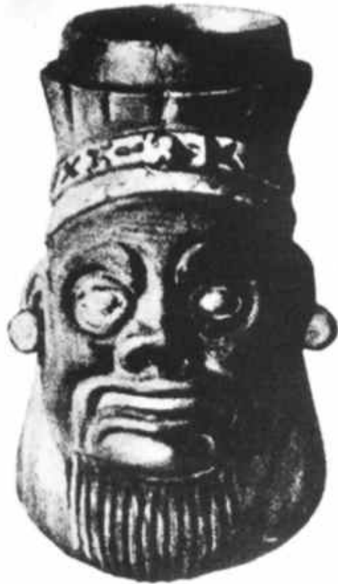
Bearded Man on Vase from Quirigau Guatamala Ancient America and The Book of Mormon P.146