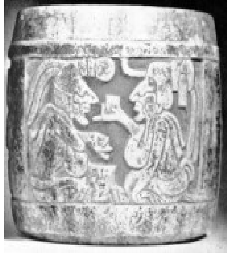
Figure 8 Maya Vase Decorated With Hebrew Like Men From Archaeology And The Book of Mormon