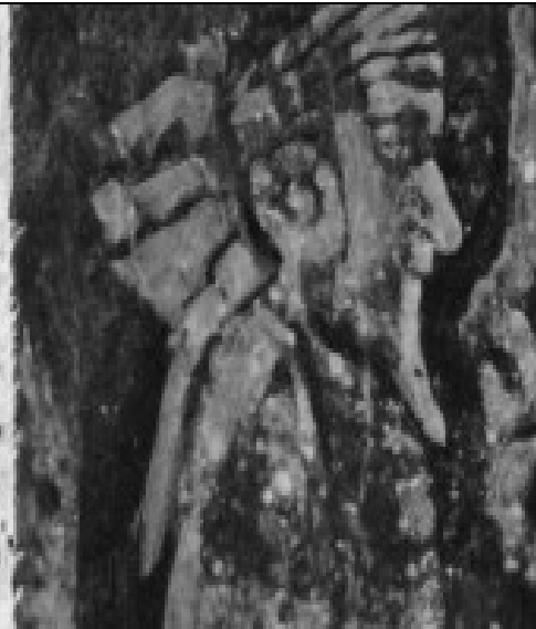
Figure 9 Bearded Man Carving From Old Chichen Itza Yucatan Mexico From Archaeology And The Book of Mormon