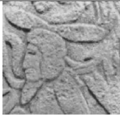
Figure 4 Hebraic-Like Bearded Man at Temple of Chichen Itza Photo By Milton R. Hunter From Archeology And The Book of Mormon