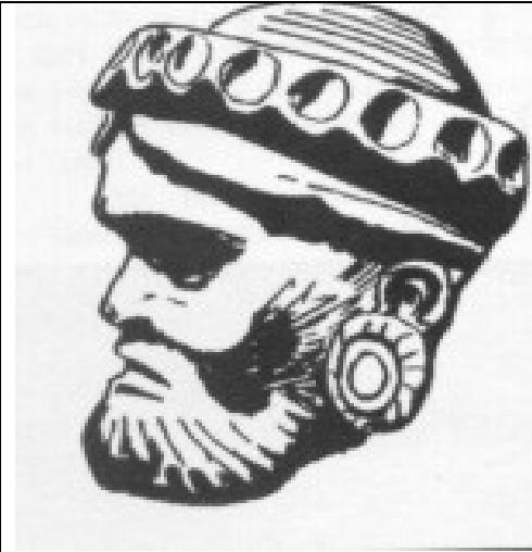
Figure 12 Bearded Head Head From Vera Cruzm Mexico From The Ancient American #12 p. 28