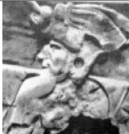
Figure 6 La Venta Bearded Man "Uncle Sam" From Archaeology And The Book of Mormon