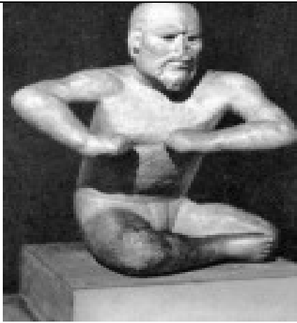
Figure 3 Olmec Statue of A Bearded Man From National Museum of Mexico