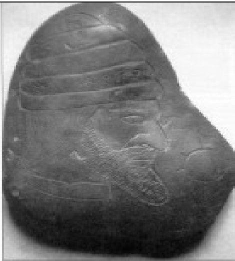
Tablet With Bearded Face Found in Mystery Cave in Illinois From Ancient American #16 p. 8