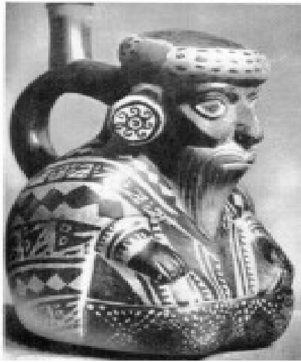
Figure 7 Early Chimu Pottery Jar Decorated With Bearded Man From Thor Heyerdahl 's American Indians in The Pacific