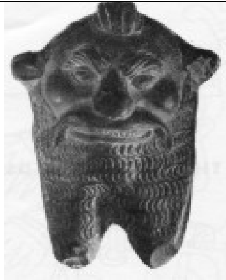
Figure 10 Beaded Figure From the Rio Balsas, Guerrero Mexico , American Museum of Natural History. From Book by Diane E. Wirth Discoveries of Truth p. 64