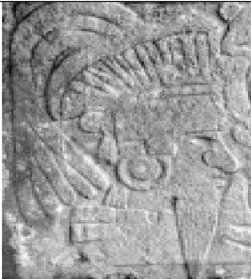
Figure 5 Bearded Figure of Kukulcan Maya God From Book Archeology And The Book of Mormon