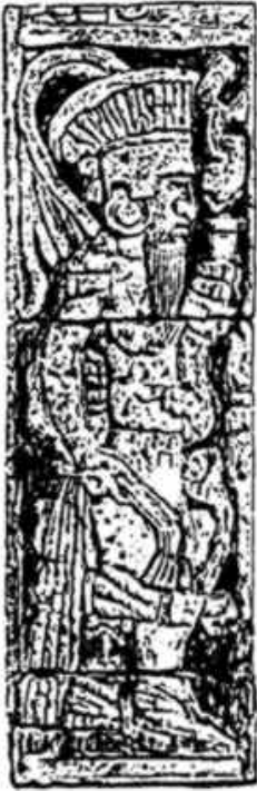
Bearded Warrior from Yucatan From The Lost Realms by Zecharia Sitchin, Bea & Co. Santa Fe NM, 1990