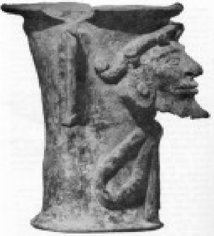
Figure 11 Bearded Semitic incense Burner from Iximche Guatemala Musee de l Homme, Paris from Discoveries of Truth p.70